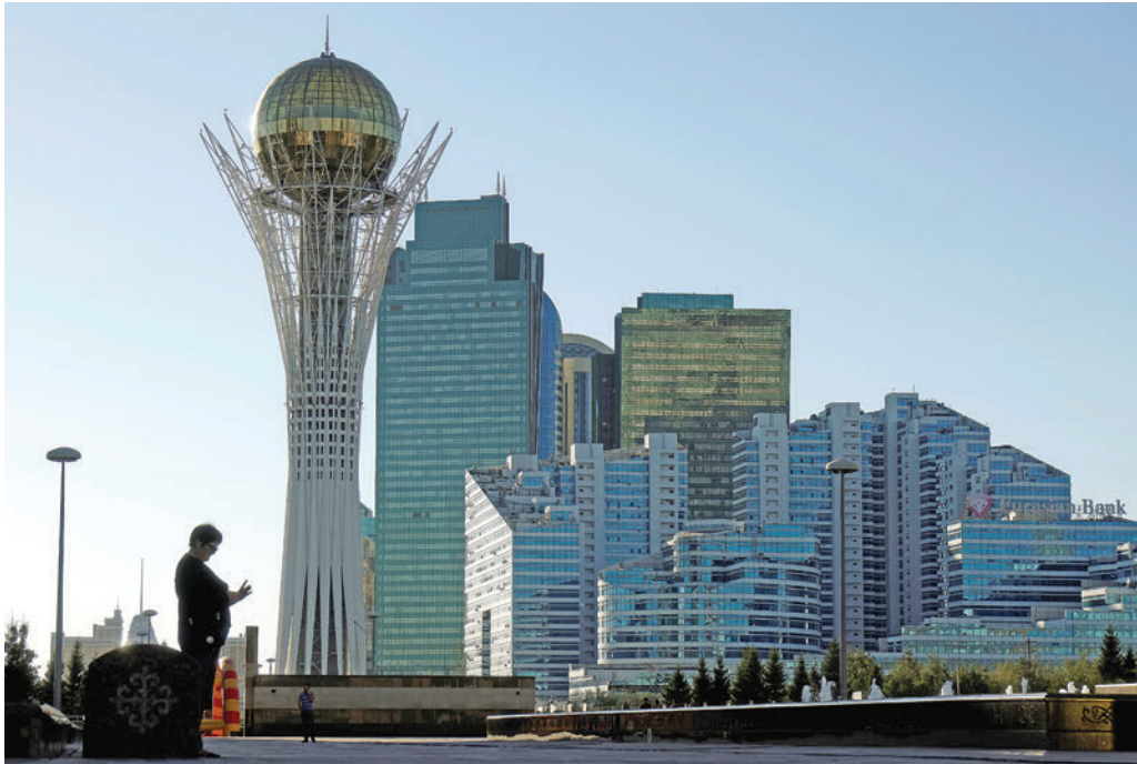
The dictator's dividend: a monument in Astana, Kazakhstan, September 2016

future promises two realistic scenarios: either some of the most powerful autocratic countries in the world will transition to liberal democracy, or the period of democratic dominance that was expected to last forever will prove no more than an interlude before a new era of struggle between mutually hostile political systems.